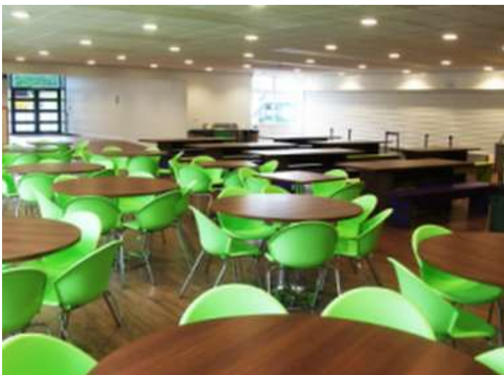
- Completion -