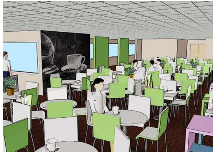
- Three-Dimensional -